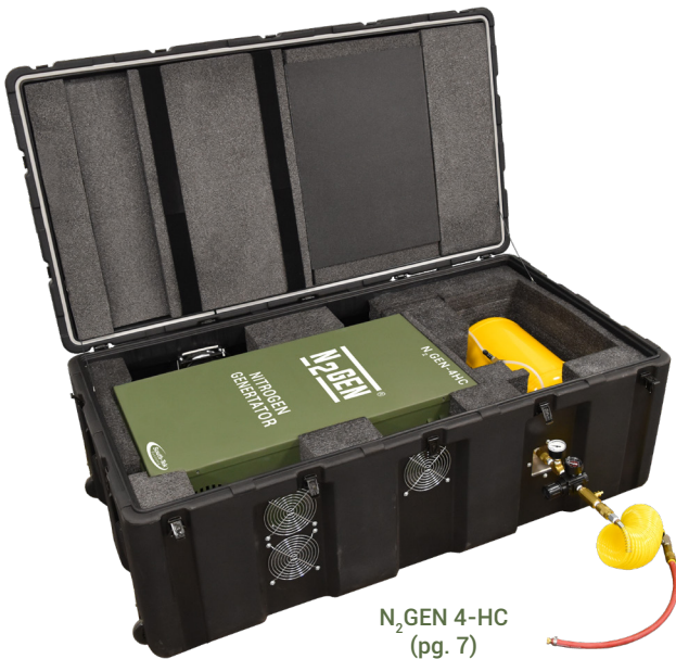
N 2 GEN 4-HC (pg. 7)

South-Tek offers stationary models for shops and shelters, as well as fully-deployable, heavy-duty compact systems that go wherever you need nitrogen. Our generators are designed to meet a variety of low- and high-pressure needs.