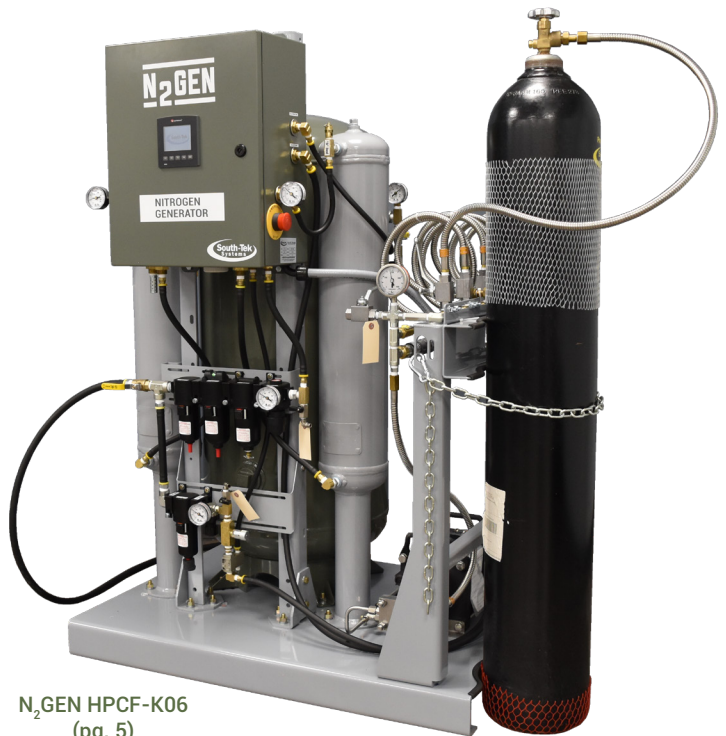
N 2 GEN HPCF-K06 (pg. 5)