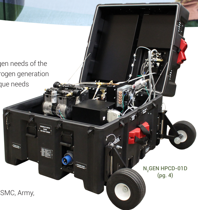
N 2 GEN HPCD-01D (pg. 4)

In addition to our standard military product offering, South-Tek custom engineers systems to support R&D, testing and manufacturing applications at military installations around the world. Select installations include: China Lake in the US Navy, Tinker Air Force Base, Selfridge AFB, Aberdeen Proving Grounds, and US Naval Shipyards at Portsmouth and Pearl Harbor.