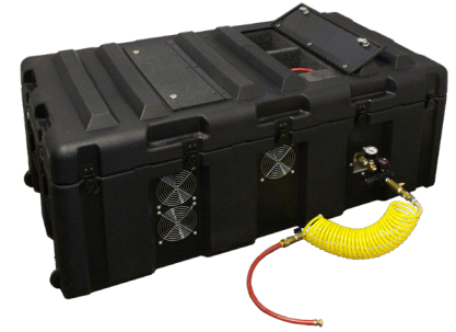
Fully operable with case closed for protection.