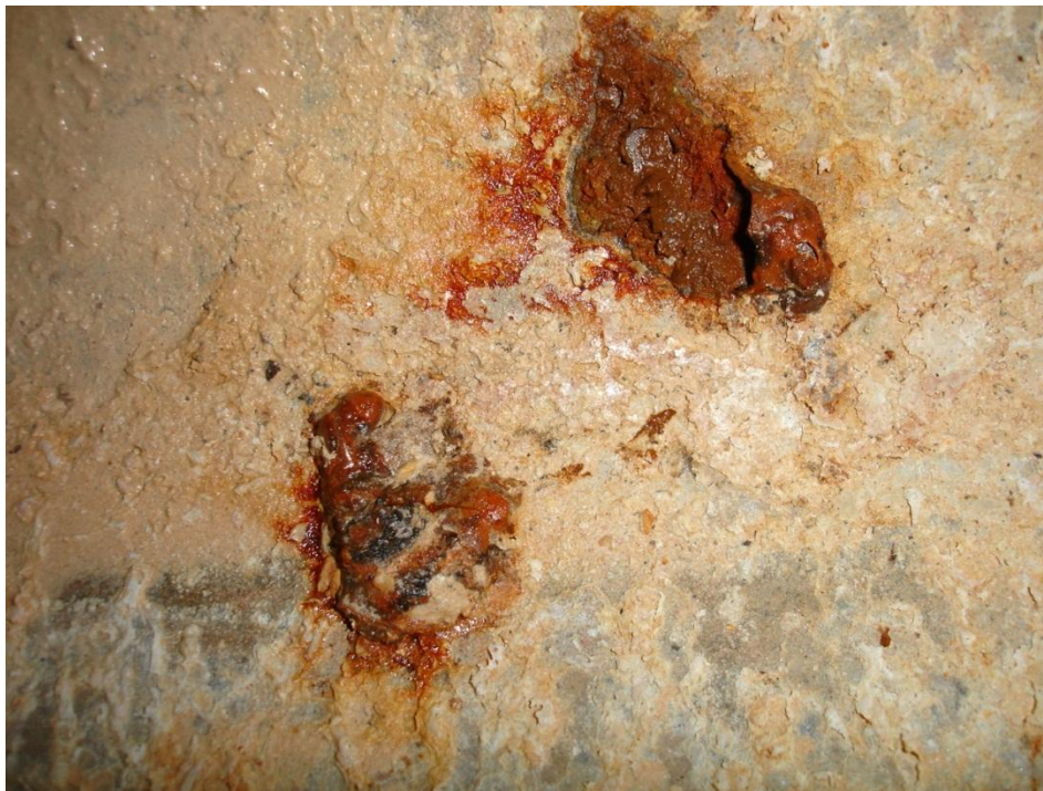
Figure 4. Close-up view of localized tubercles under air/water interface on interior surface of pipe sample (Note reddish-brown color of tubercles indicative of ongoing corrosion of the underlying steel pipe wall).