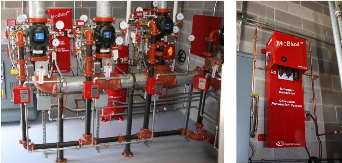
Figure 9. Nitrogen generator system for supervision of Preaction system

This turn-key system was installed approximately four years ago and has performed above expectations. The maintenance has been minimal, requiring only annual oil changes and compressor air filter replacements. Annual inspections to assess the condition of the newly installed piping have revealed no indications of recurrence of the localized corrosion. The source of city water being utilized for hydrotesting and the working conditions of the piping remain unchanged. Currently, the corrosion penetration rates are negligible and no pipe replacement has been warranted since the introduction of Supervisory Nitrogen approximately 5 ½ years ago.