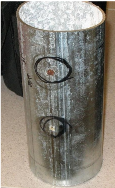
Figure 1. Pinhole leaks on galvanized, Schedule 40 piping from 2 ½ year old Preaction system.

The Preaction system was constructed of galvanized, schedule 40 steel pipe and supervised with compressed air.