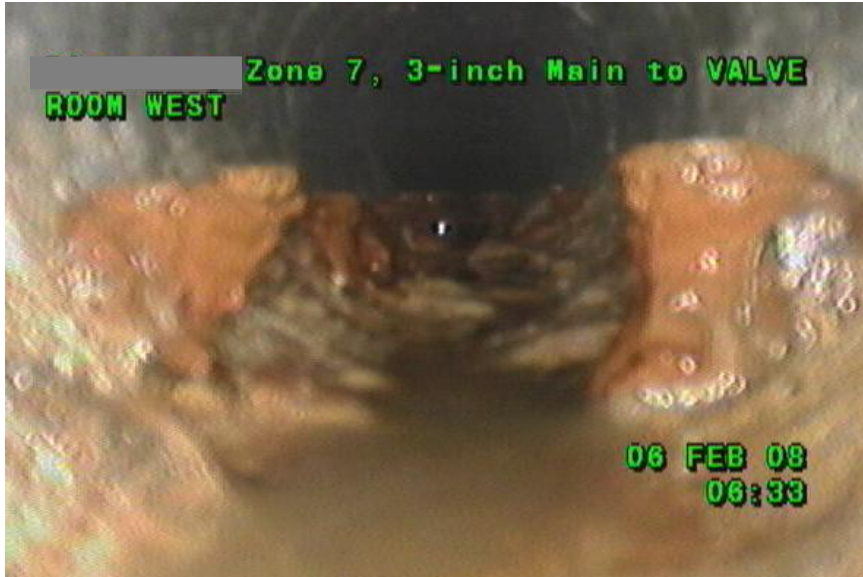
Figure 2. Representative image of pipe interior approximately 2 ½ years after installation.

A subsequent investigation and failure analysis confirmed that the residual water was widespread throughout the system and that the corrosion and pinhole leaks were invariably associated with these areas of residual water. Pipe and water samples removed from various locations in the system showed significant wall thinning at localized pits, which coincided with the reddish-brown tubercles. Microbiological culturing to investigate the possibility that microbiologically influenced corrosion (MIC) was fully or partially responsible for the rapid penetration of the pipe wall was negative for bacteria that are associated with MIC. Water chemistry was found to be normal and not corrosive in any way. Metallurgical analysis of pipe samples indicated that the corrosion was the result of the combined effect of residual water and Oxygen-rich compressed air. The following series of photographs show the morphology localized pitting associated with such areas (Figure 3 through Figure 7).