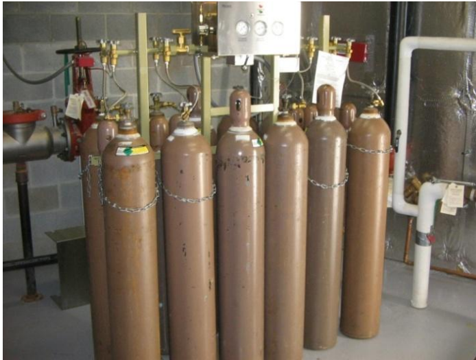
Figure 8. Nitrogen cylinder manifold for supervision of the Preaction system

of the system was impossible. A decision was made to install and/or reposition manual, auxiliary drains wherever deemed necessary and convert the system to a Nitrogen-supervised system to prevent the recurrence of Oxygen-driven, internal corrosion. At the time, the only viable source of high-purity Nitrogen was either liquid Nitrogen from an outside tank or high pressure cylinders. A custom designed manifold was installed with two banks of high pressure Nitrogen gas cylinders to facilitate an uninterrupted Nitrogen supply during a switch from one bank to another.