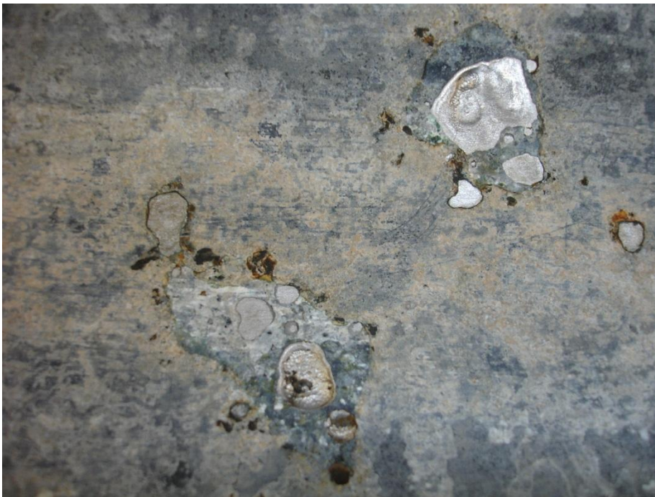
Figure 6. Close-up view of interior pipe surface condition of bottom half of 6" main sample after removal of corrosion product deposits (Note shiny localized pits indicative of active, ongoing localized corrosion).