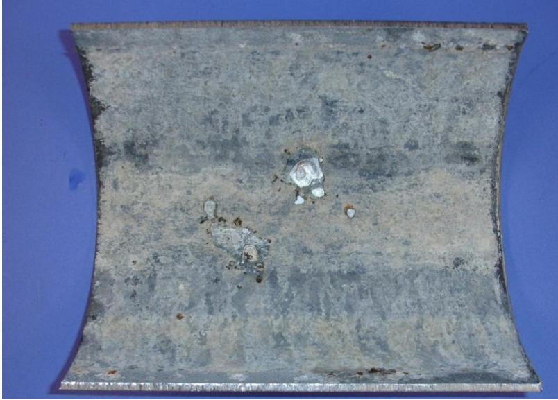
Figure 5. Overall view of as-found condition of bottom half of 6" main sample after removal of corrosion product deposits.