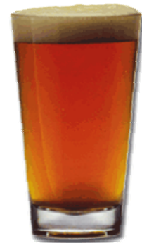
The BeerBlast™ N2-GEN assists in providing the perfect blend!

South-Tek’s line of BeerBlast™ N2-GEN systems creates its own 99.8% pure N 2 from the air thus reducing your operations efforts and costs, while maintaining product quality.